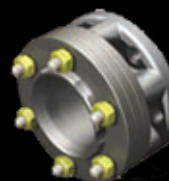
6 Hole 3.5" Spacer