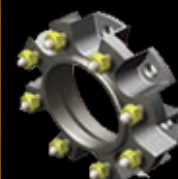
8 Hole 2" Spacer

As a basic rule, to ensure a minimum clearance of 3" between the tire and any machine part, wheel spacers may be required