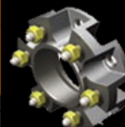
6 Hole 2" Spacer