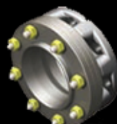
8 Hole 3.5" Spacer